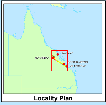
Mapsheet Overview - 1: 100,000