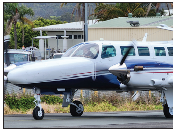
An example of the type of plane used.

For information, please phone 1800 038 856 (toll free) or email info@arrowenergy.com.au