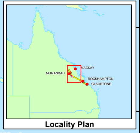
Map 12: Line pipe distribution routes for DN1050 line pipe from Port of Mackay