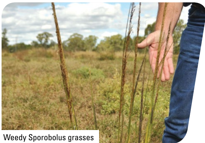
Weedy Sporobolus grasses