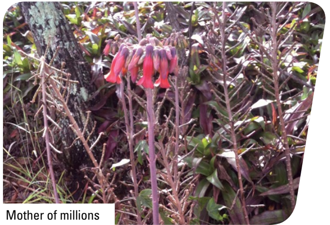
Mother of millions