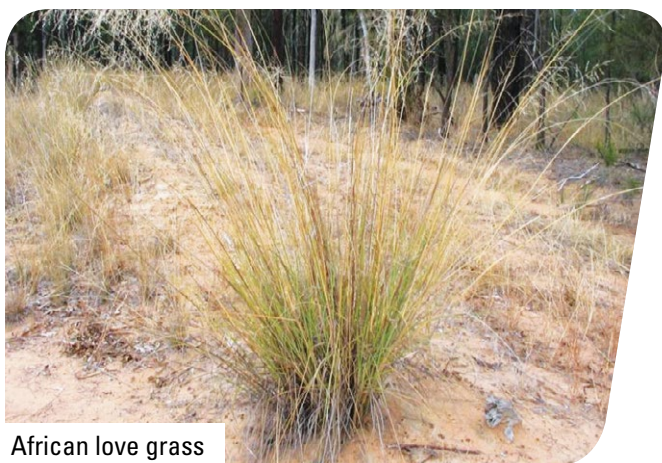
African love grass