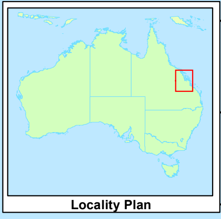
Map 1: Overview